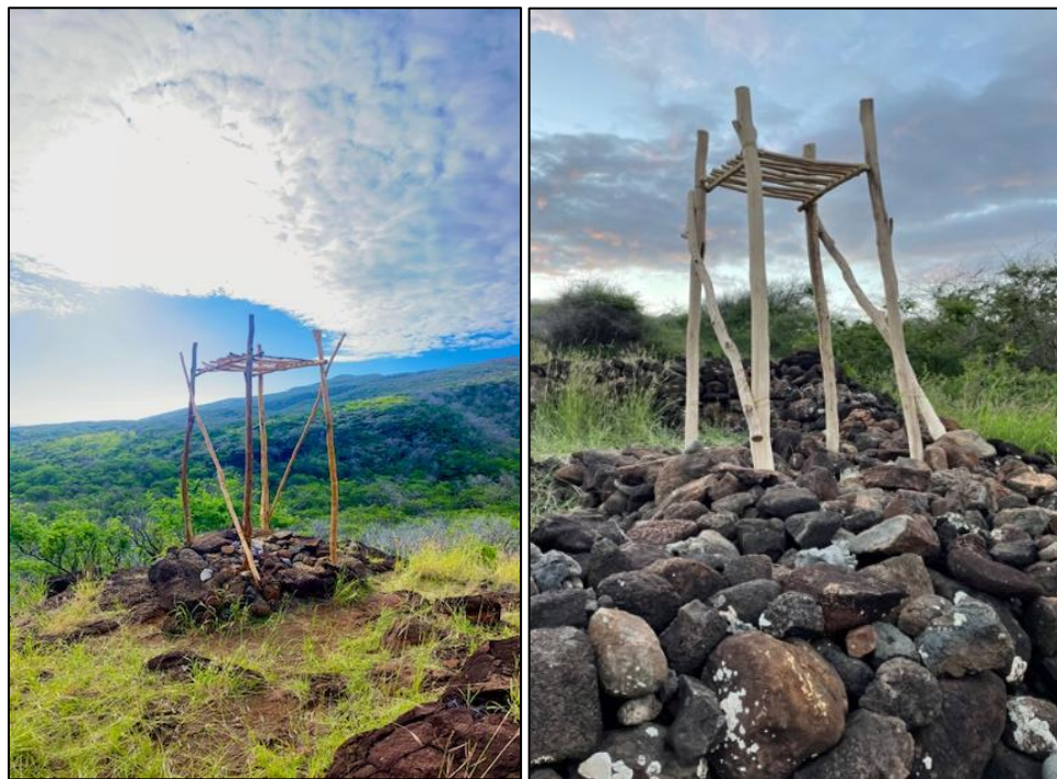
Figure 1. Hale o Papa, left photo and Hale Mua, right photo