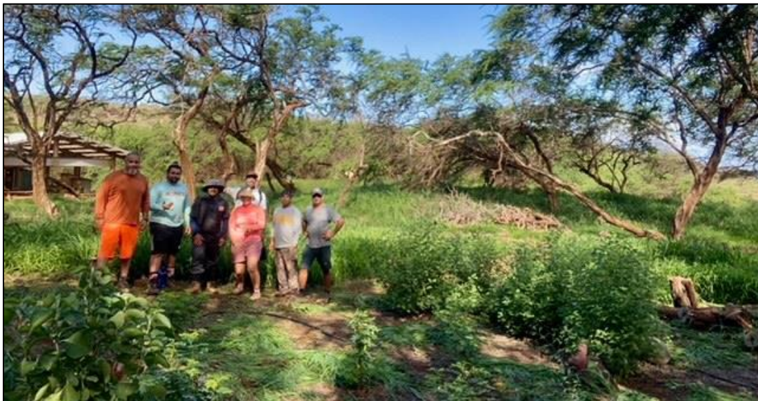
Figure 5. Family Photo