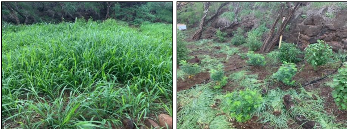
Figure 3. Native Plant friends, before and after hand clearing weeds