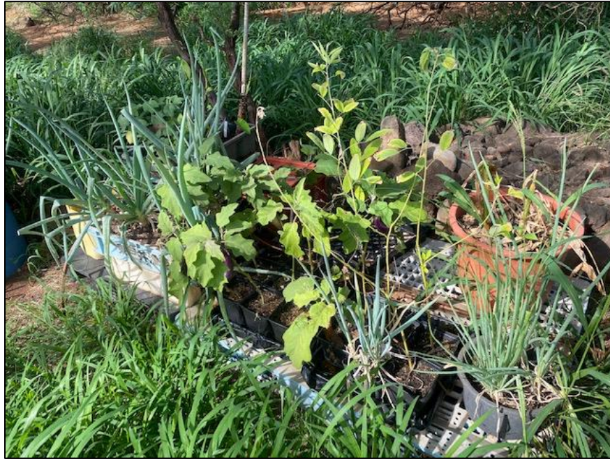
Figure 4. Māla ‘ai