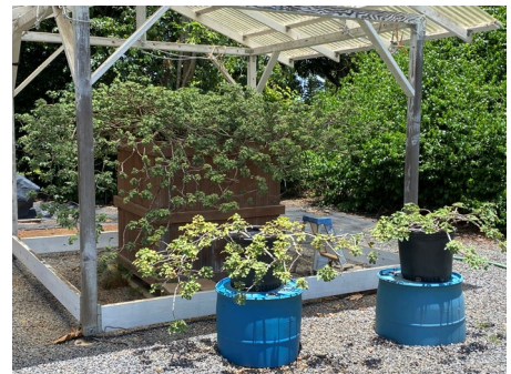
Kanaloa kahoowawensis plants in cultivation.