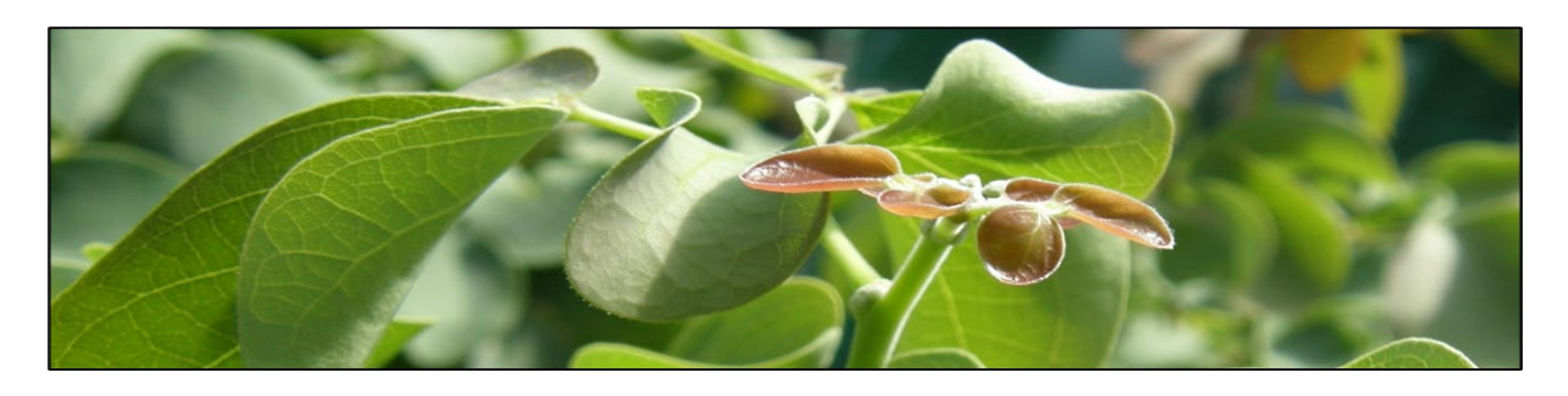
Restoration: Coastal and Upland Wetland Restoration of Kahoolawe