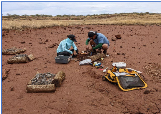
UH Soil and Ecosystem Lab collecting soil samples.

This Project is now complete. Final report included billing and a Best Management Practice (BMP) write up for use and implementation of Biochar on Kaho‘olawe.