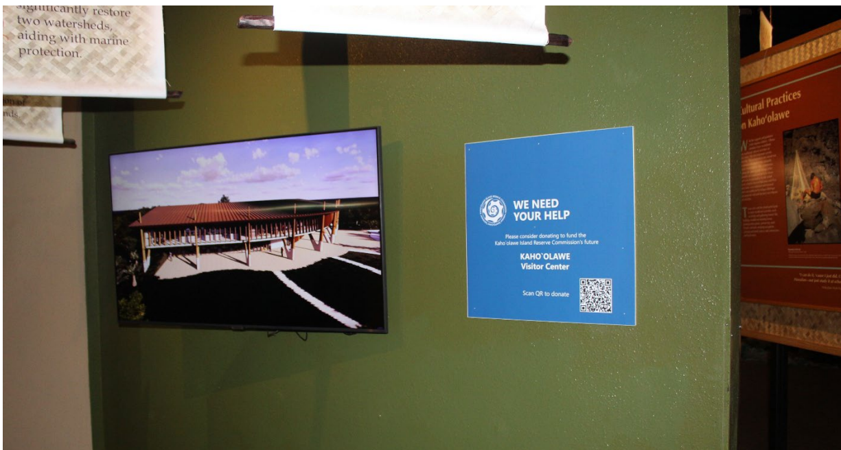
Video Display on Kihei Center with separate QR code