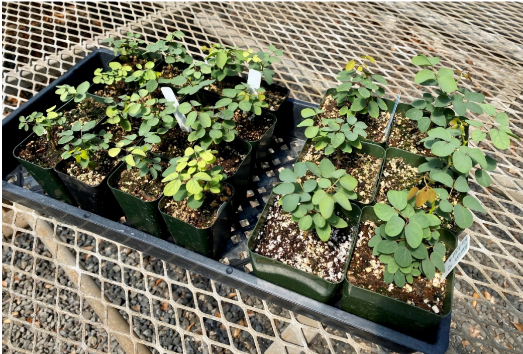
Twenty-two seedlings of K. kahoalawensis at Ho‘olawa Farms

Twenty-two seedlings of K. kahoalawensis were recently established in April 2020 at Ho‘olawa Farms.