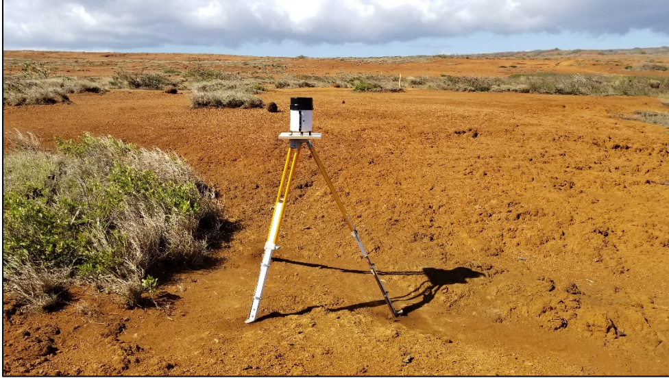
New rain gauge near Pōkāneloa Stone (February 2020)