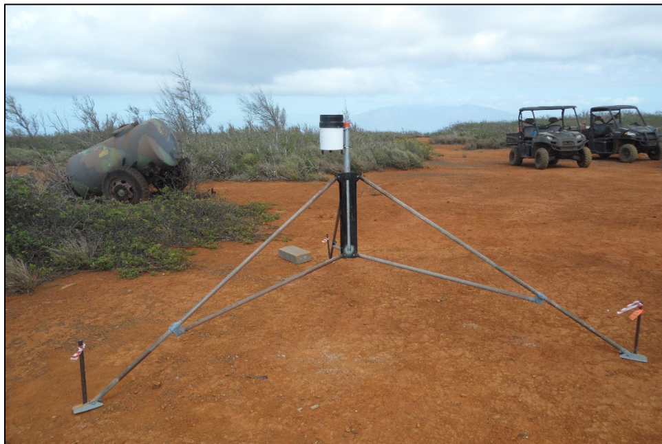
New rain gauge at Rain Catchment at Luamakika (January 2020)

Two new rain gauges were installed on island. One is near the rain catchment and was initiated in January 2020. The other was placed near the Pōkāneloa Stone in February 2020. Also, a stream stage monitoring device was installed in the Kaneloa stream (near the Pōkāneloa Stone) in January 2020 to measure height of the stream water when it rains. This stream data will be correlated to the rain gauge data.