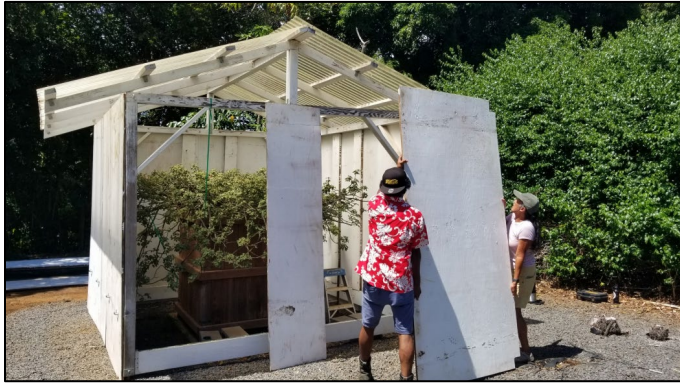
Protective barrier being installed at Ho'olawa Farms for Hurricane Douglas

Although the large individual plant at Ho'olawa Farms died in July 2020 the pollen it produced helped to establish these twenty-two seedlings. The Kanaloa Management Plan was updated with peer review to include a tracking table for the new seedlings. Hurricane Douglas prompted personnel from the KIRC, PEPP and Ho'olawa farms to install a temporary protective barrier (July 25, 2020).