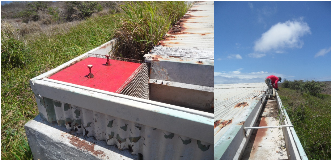
Intake of rain catchment with vegetation in gutter. Cleaning out gutters.

The rain catchment roof gutters were cleaned, and the intake was repaired. Restoration staff also controlled brush around the west portion of the structure.