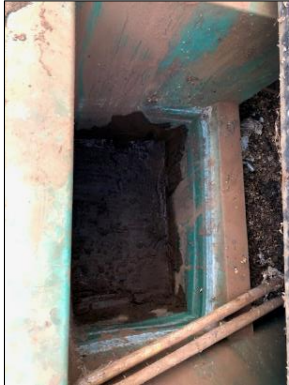
Figure 1. Before: anoxic water/sludge from makai side lua [Lāna'i side]