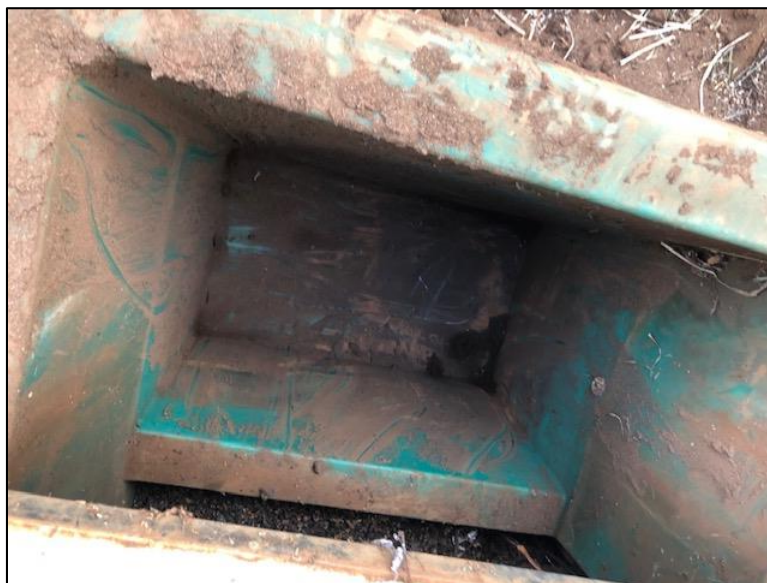
Figure 2. After: cleared anoxic water/sludge from makai side lua [Lāna'i side]