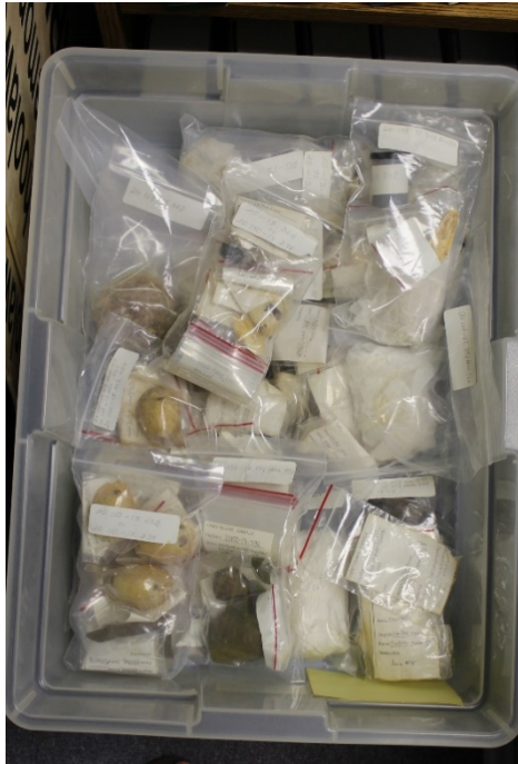
Samples from Navy Collection in original container