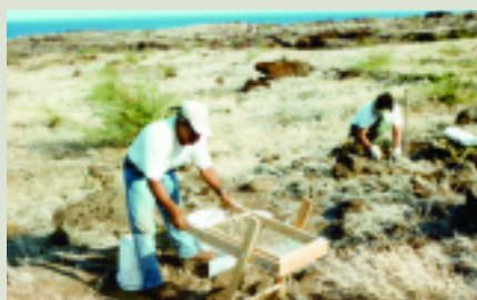
More than 600 archeological features have been identified on Kaho'olawe.