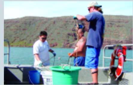
Setting Lines for Ulua

Cultural and “grassroots” information were used as a starting point for biological investigation. It is hoped that scientific evidence will bridge the gap between two different approaches to the same knowledge in better understanding and protecting our marine resources.