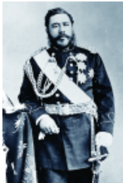
King David Kalakaua

In its history, Kaho’olawe has been used for many purposes. At various times it served as a school for navigation, a cattle ranch, and, for a short period, a men’s prison. The island has also been used as a fishing village, a bombing range, and has even been visited by Hawaiian royalty.