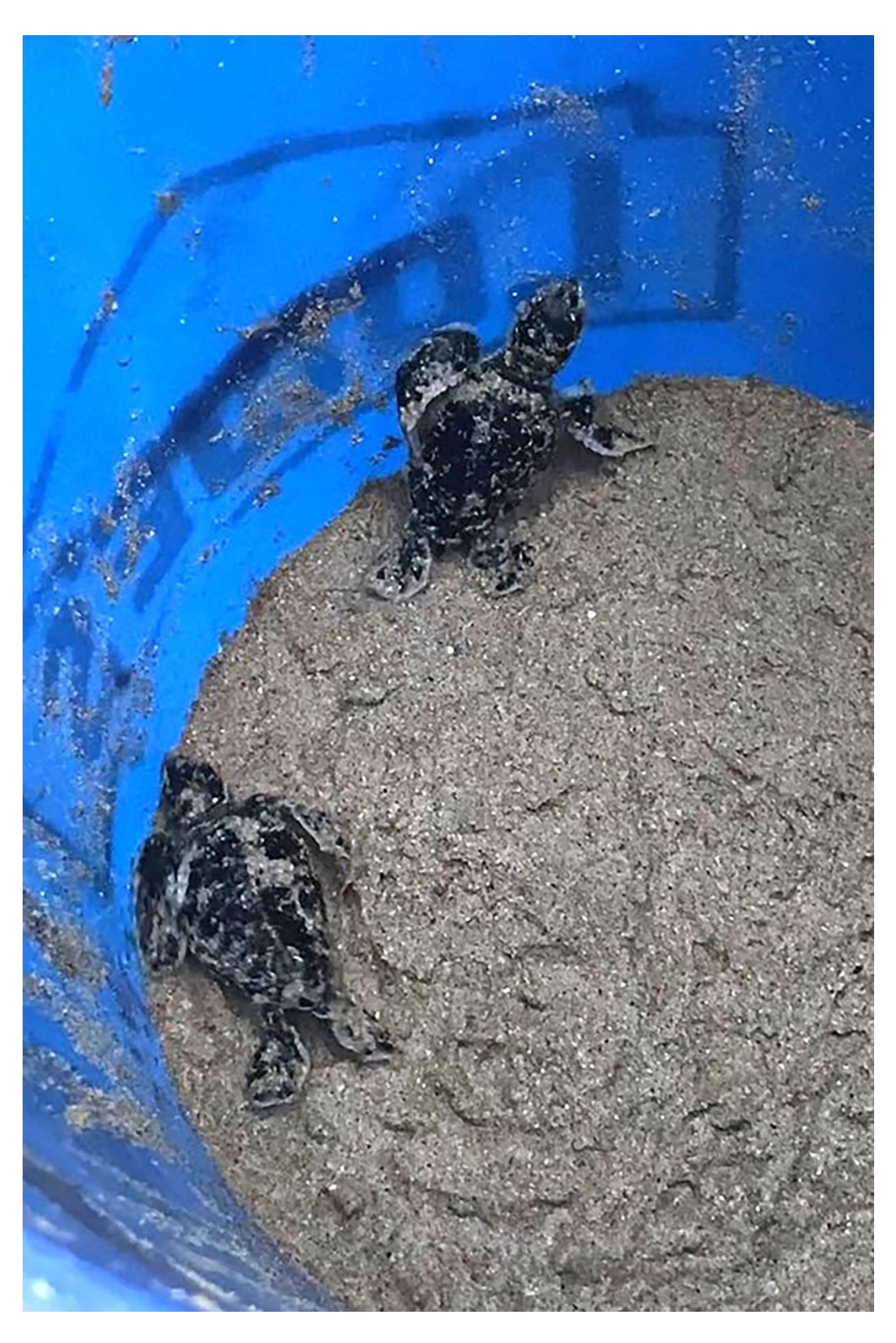
Two rescued turtle hatchlings that were trapped before being released on Honokanai'a Beach, Kaho'olawe. August 2024