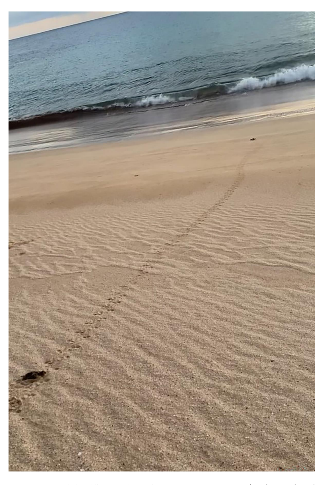
Two rescued turtle hatchlings making their way to the ocean on Honokanai'a Beach, Kaho'olawe. August 2024