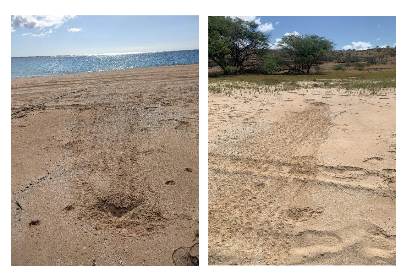
Turtle hatchling tracks imprinted on Honokanai'a Beach, Kaho'olawe. August 2024