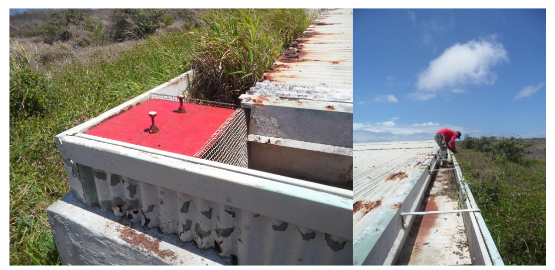
Intake of rain catchment with vegetation in gutter. Cleaning out gutters.

The rain catchment roof gutters were cleaned, and the intake was repaired. Restoration staff also controlled brush around the west portion of the structure.