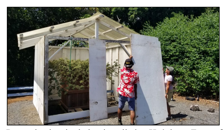
Protective barrier being installed at Ho'olawa Farms for Hurricane Douglas

Although the large individual plant at Ho'olawa Farms died in July 2020 the pollen it produced helped to establish these twenty-two seedlings. The Kanaloa Management Plan was updated with peer review to include a tracking table for the new seedlings. Hurricane Douglas prompted personnel from the KIRC, PEPP and Ho'olawa farms to install a temporary protective barrier (July 25, 2020).