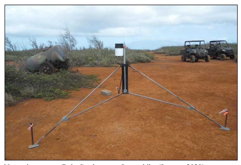
New rain gauge at Rain Catchment at Luamakika (January 2020)

Two new rain gauges were installed on island. One is near the rain catchment and was initiated in January 2020. The other was placed near the Pōkāneloa Stone in February 2020. Also, a stream stage monitoring device was in installed in the Kaneloa stream (near the Pōkāneloa Stone) in January 2020 to measure height of the stream water when it rains. This stream data will be correlated to the rain gauge data.