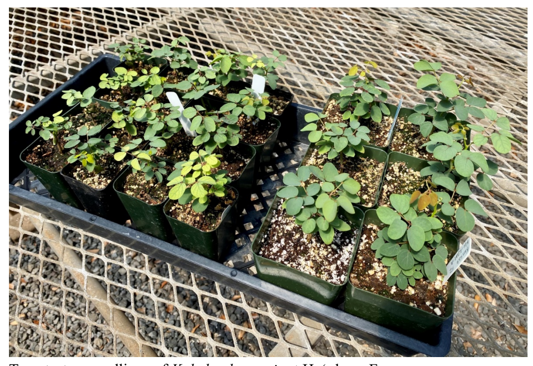
Twenty-two seedlings of K. kahoolawensis at Hoʻolawa Farms

Twenty-two seedlings of K. kahoolawensis were recently established in April 2020 at Hoʻolawa Farms.