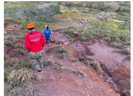
Figure 4. KIRC PIS and KUPU Interns coming down from Pu'u 'O Moa'ula Iki.

In addition to the standard outreach, media, grant writing and on-island activities described above, the PIS also worked on a special project between December and March, participating as a group member with several representatives from the Protect Kaho'olawe 'Ohana in an 8-week long Adaptation Planning and Practices Course, meant to help conservation project planners in drafting and executing realizable goals and objectives in their own spaces. Through the 8-week process, the group drafted an outline of a "pilot caretaker" project that would focus on establishing a restoration project site above Hakioawa. Although the course is completed, the group continues to meet on a regular basis, trying to move the project proposal forward towards actual funding opportunities. The next step is to bring the planning group to Kaho'olawe through a KIRC access to discuss actual project sites and logistics on the ground.