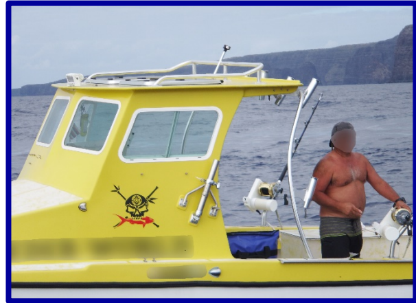
"Under-World" documented in the Reserve

• In January, program staff participated in 'Ohua crew training held in Honokanai'a Bay. Exercises in the training covered everything from "man overboard" drills to discharging flares to safety equipment location and utilization. During the same access crew spotted an unauthorized fishing vessel in the Reserve near Kaka Pt. Photos, location and vessel identification were submitted to DOCARE personnel. KIRC staff onboard at the time provided witness statements to the officer handling the case.