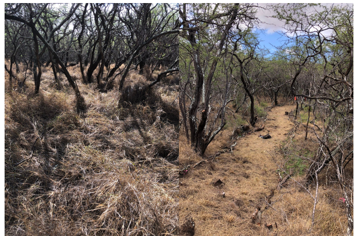
Trail in Ahupūiki before and after