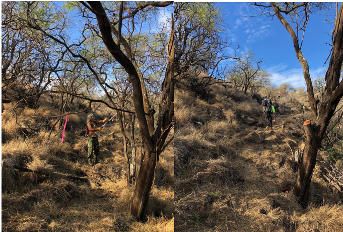
Trail from Ahupū to Ahupūiki before and after