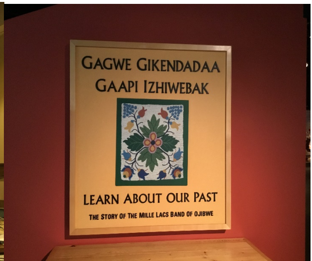
Entryway into Mille Lacs Indian Museum, Vineland, MN